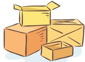
boxes / boxes