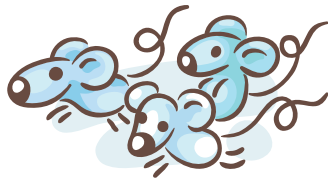
mice / mouses