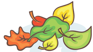
leafs / leaves