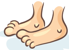
foots / feet