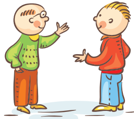
men / mans