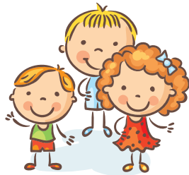
childs / children